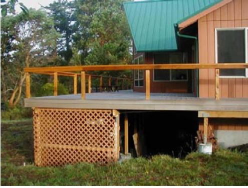
Cistern underneath deck of home in San Juan County