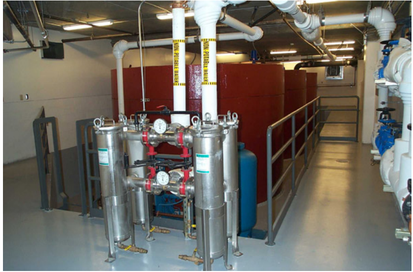
Commercial cisterns in Seattle used for toilets and irrigation