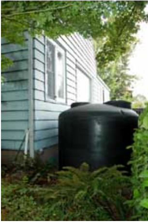
Example of a Residential cistern