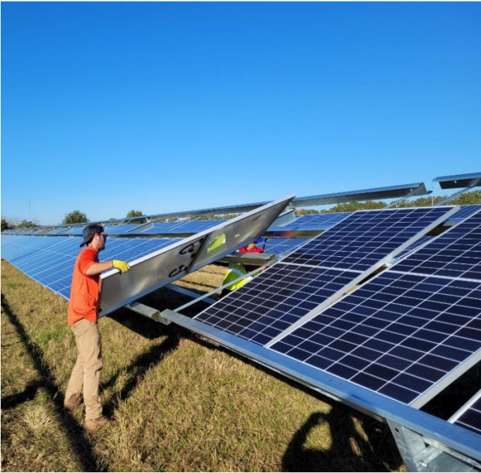
Solar panels being installed