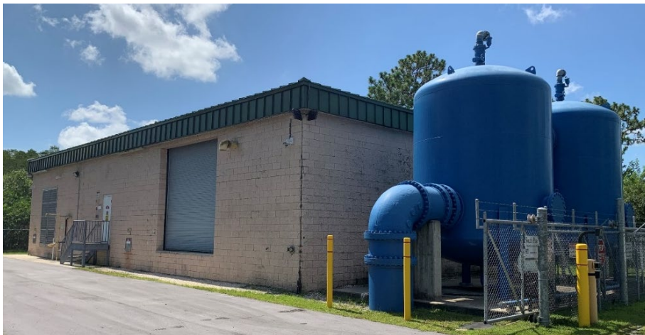
South Pasco Water Treatment Plant