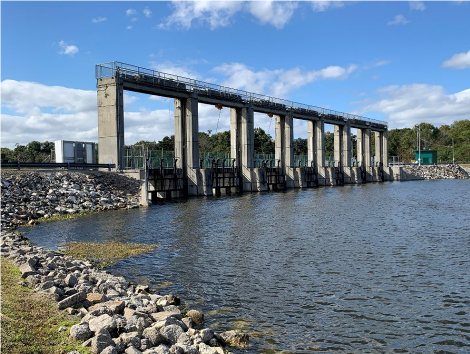
Structure 162 and gates