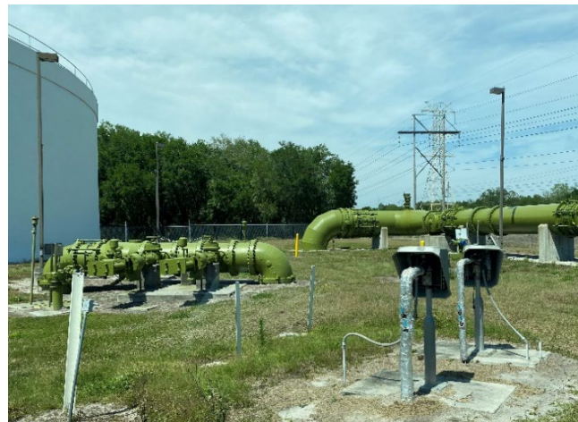
Repump valve repair location