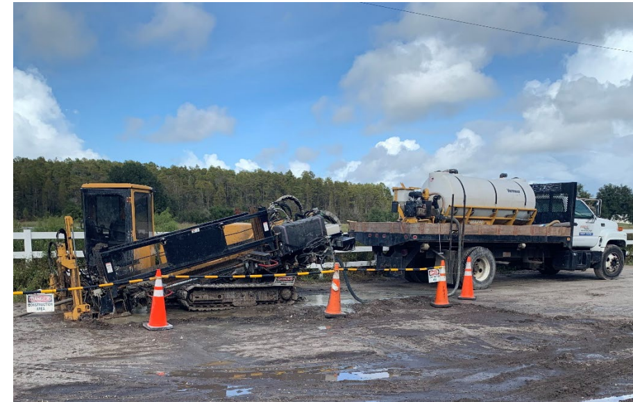
TECO installing underground power

Wellfield improvements cost: $13,321,865 (up to $750,000 in state funding) Powerline replacement cost: $1,491,407 Completion: Summer 2023