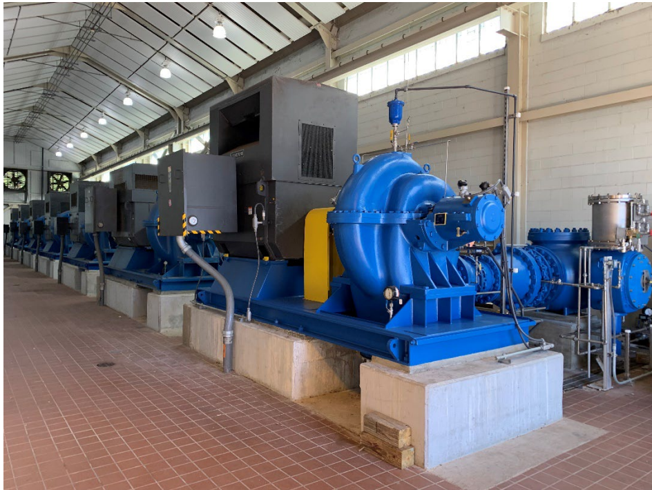
Pump and motor