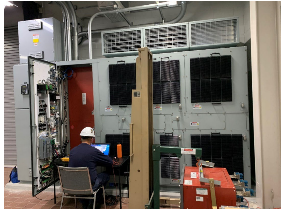
Variable Frequency Drive Testing

Cost: $2,168,480 (co-funded by the Southwest Florida Water Management District)