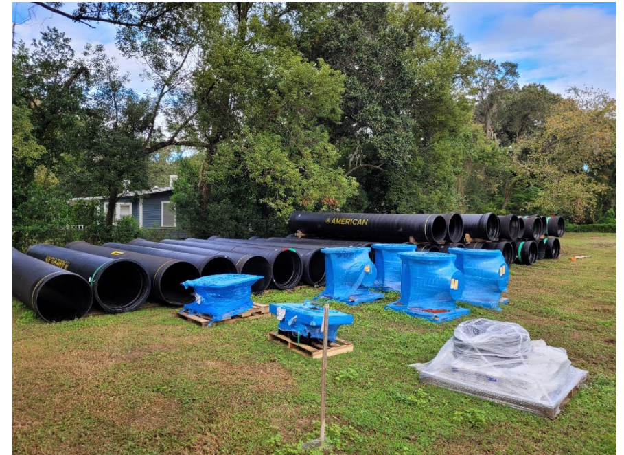
30" pipe and fittings