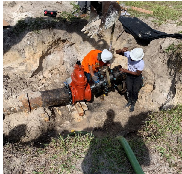
New gate valve installed