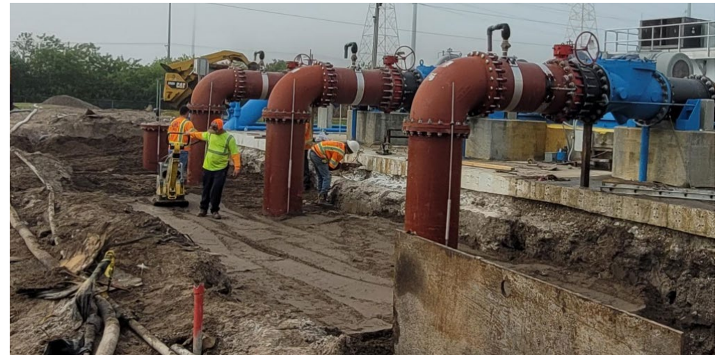
Desal Finished Water Line Repair