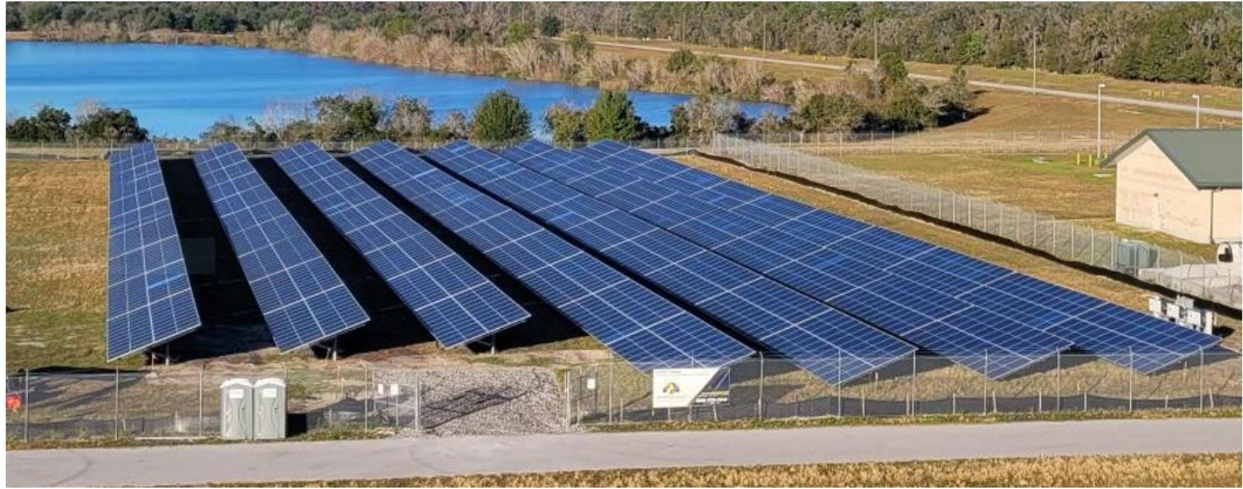
View of solar field from the reservoir embankment