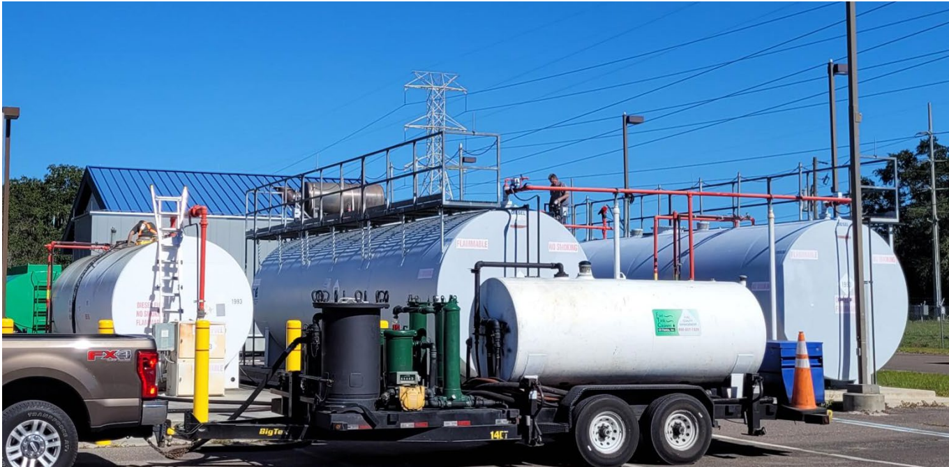
Set up for cleaning tank 1