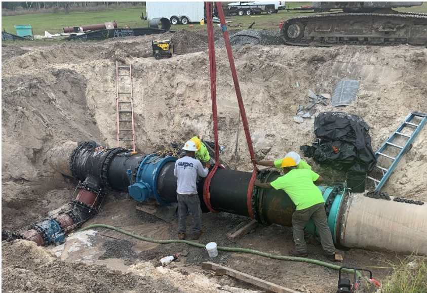
Piping modification in wellfield