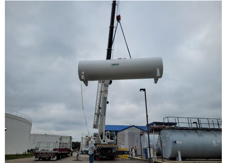
New 12,000-gallon fuel tank