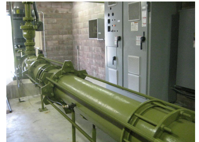
Cypress Bridge wellhouse interior