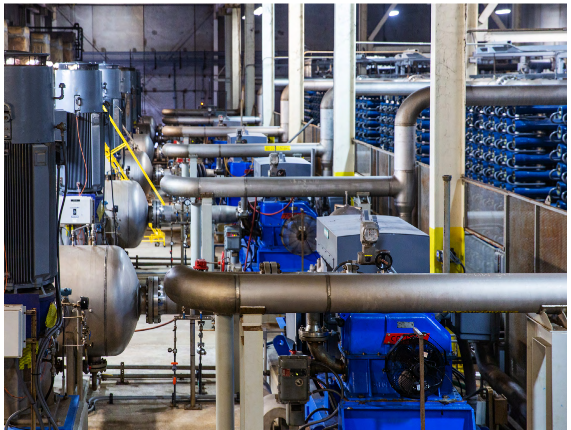
High pressure pumping system at the Tampa Bay Seawater Desalination Plant

This project is one of three top-ranked projects under further evaluation to meet the region's drinking water needs in the 2028 timeframe. The potential projects are the culmination of five years of analysis through Tampa Bay Water's Long-term Master Water Plan. This 20-year framework for meeting the region's future drinking water needs includes analyses of future demand, conservation potential, supply reliability, water shortage mitigation planning and hydrologic uncertainty along with potential water supply projects to ensure adequate drinking water in the future. For more information, visit tampabaywater.org /future-drinking-water-sources .